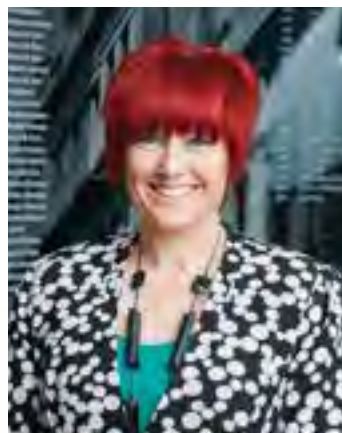
Rocky Slater Chair Construction Council