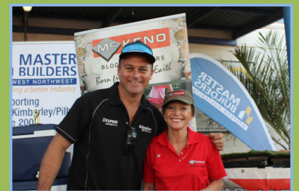
SHORTEST DRIVE #3