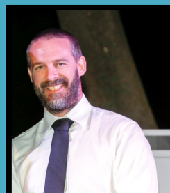
MBA INSURANCE SERVICES Insurance Partner a Master Builders service