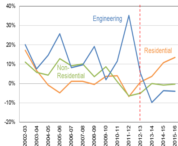
Building and Construction Value of Work Done, Australia (2010-11 prices, %ch)

The forecasts are set against a background of a two speed economy with weak activity outside of mining, fiscal consolidation, poor sentiment, a high Australian dollar and soft labour market. The forecasts reflect highly variable prospects for the building and construction industry by sector and state, with Queensland, New South Wales and parts of the Western Australian building industry set to enjoy better times after a number of challenging years.