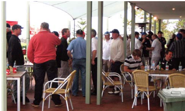
UNWINDING – A PERFECT FINISH TO A GREAT DAY OF GOLF

The Overall winners on the day were the Summit Homes group followed closely by Innovest Construction and Scott Park Homes.