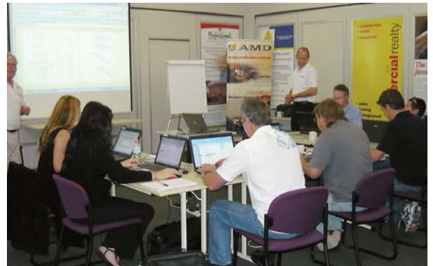
PERFECT PROJECT MANAGEMENT PRESENTING TO SOUTH WEST MEMBERS