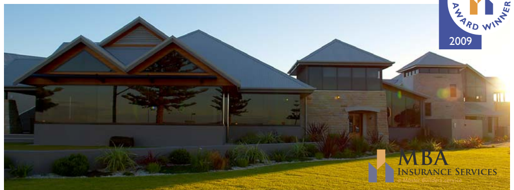
MBA Insurance Services Best Country Home for the Goldfields Esperance Region, 6 The Esplanade, Esperance - BD Partington Building Contractors