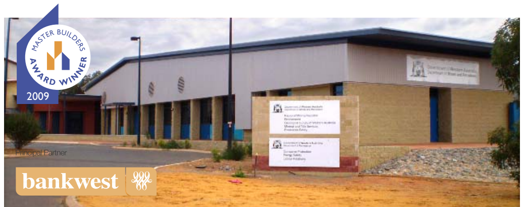
Bankwest Best Commercial Building for the Goldfields Esperance Region, Kalgoorlie Regional Centre, Duwal Constructions