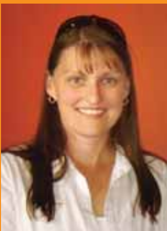
South West Chairperson