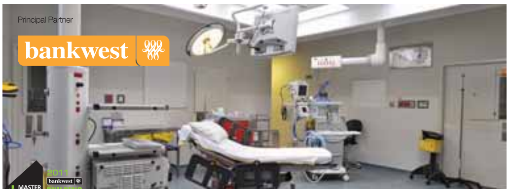
WINNER OF THE BANKWEST BEST COMMERCIAL BUILDING: Perkins Builders, Bunbury Day Hospital, Spencer Street, Bunbury