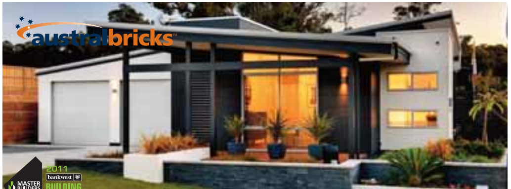
WINNER OF THE BEST DISPLAY HOME: Rural Building Company, 5 Crellin Place, Margaret River