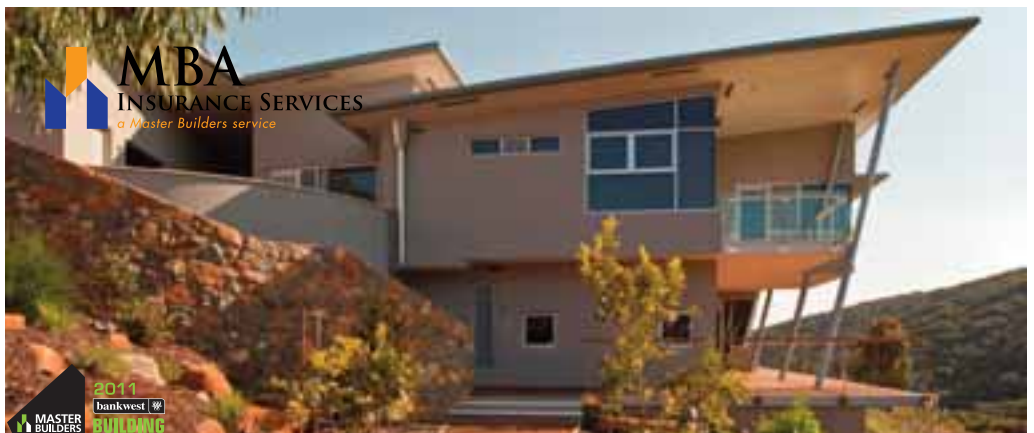
WINNER OF THE BEST REGIONAL HOME: Wholagan Building Inspiration, 350 Woodlands Road, Wilyabrup