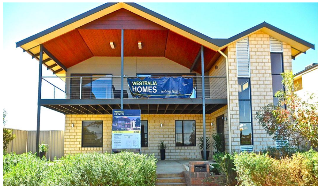
Westralia Homes, 78 Aslett Drive, Greenview