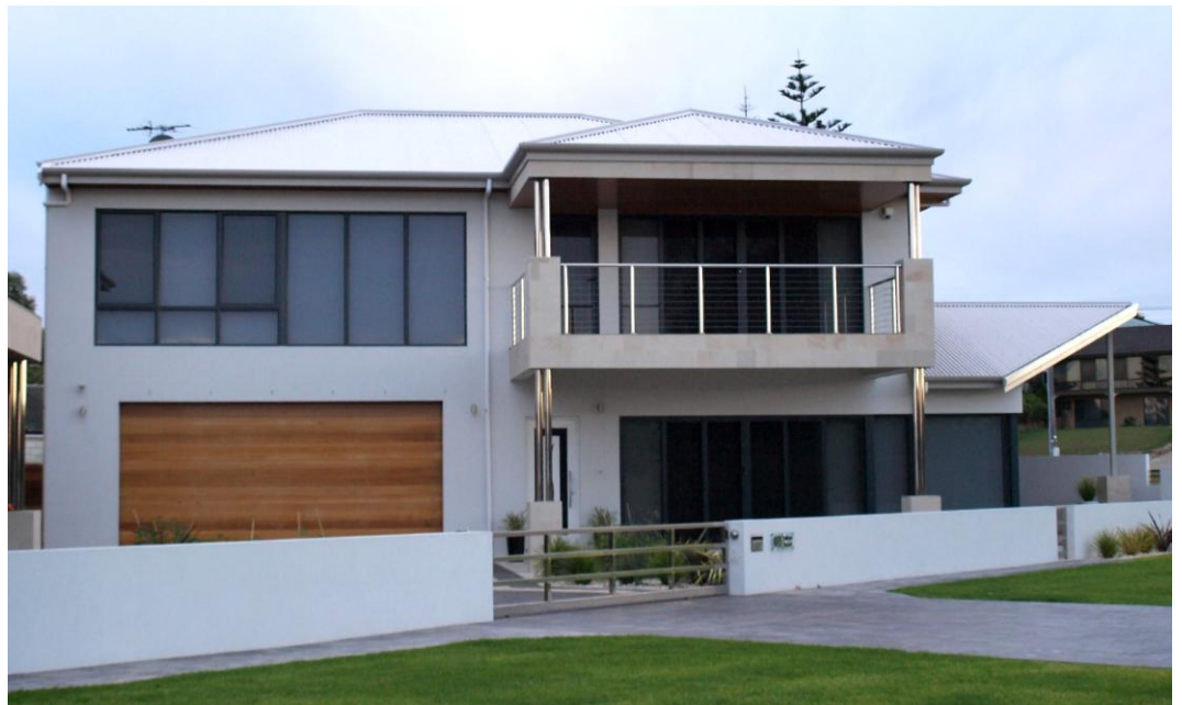
BD Partington Building Contractors, 4b Balfour Street, Esperance