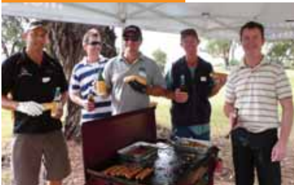
AIR CELL BBQ