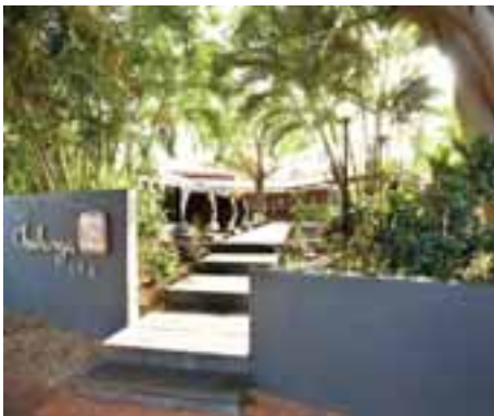
AUST ECO COMM $ 1-2.5M - CHAOYA SPA 500 CABLE BEACH ROAD

Winner: Subcontractor - Dampier Plumbing 6 Brolga Meander, Karratha Builder: Eaton Building