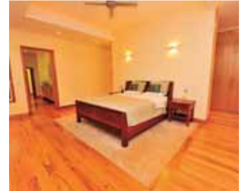
KJ'S CONT HOME - OVER $1M - 75 WALCOTT STREET

Lot 356 Kestrel Place, Exmouth Builder: DLR Building Co