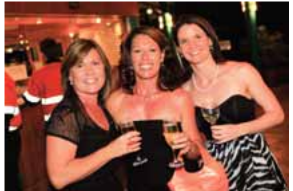
BROOME BANKWEST GIRLS