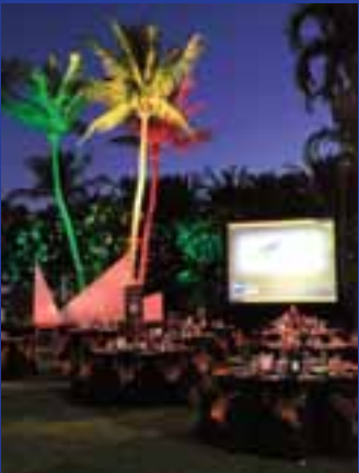
MBA MANGROVE RESORT BROOME