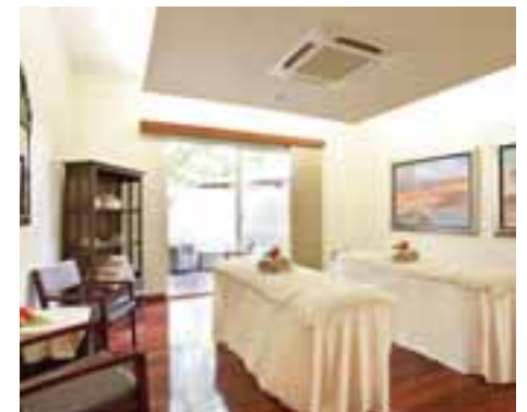
AUST ECO COMM $ 1-2.5 M- CHAOYA SPA 500 CABLE BEACH ROAD SPA ROOM

Project: L356 Kestral Place, Exmouth Builder: DLR Building Co.