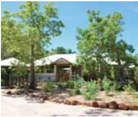
KJ'S CONT HOME - OVER $1M - 75 WALCOTT STREET