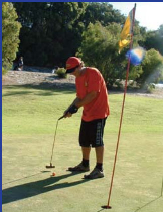
RANBUILD AND THE WOBBLY GOLF STICK

SPONSORS: ATC WORK SMART, TILLING TIMBER, HOLCIM, M&B BUILDING PRODUCTS, TELSTRA BUSINESS, HHG LEGAL GROUP, CMI, RANBUILD, KARTELL CONTRACTING AND METROOF.